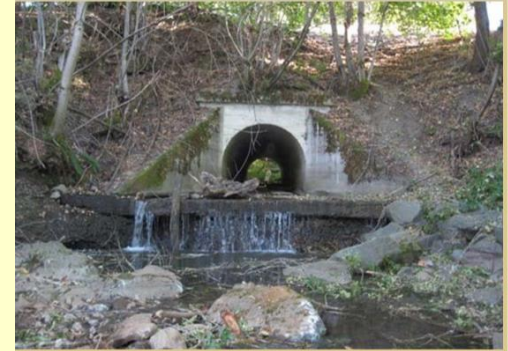
Jones Creek railroad culvert before improvement.