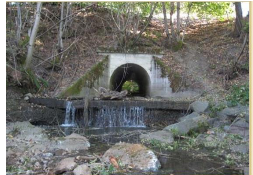
Jones Creek railroad culvert before improvement.