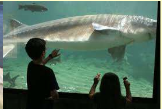
Herman the Sturgeon (@ Bonneville)