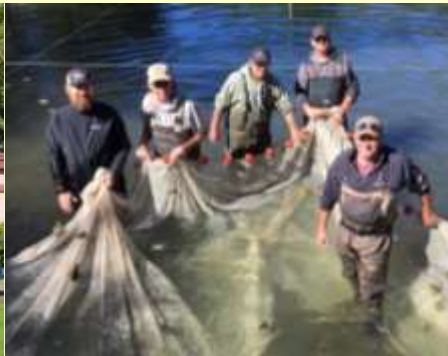
Salmon Release from Rhoades Pond