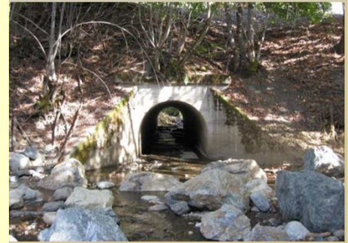
Salmon and Steelhead habitat improvement

Nothing makes a fish bigger than almost being caught. ~ Anonymous