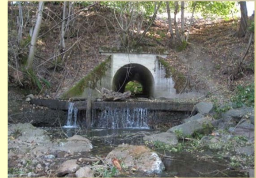
Jones Creek railroad culvert before improvement