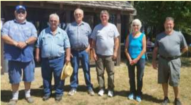
Ladderball winners at the picnic