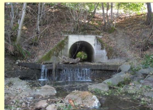
Jones Creek railroad culvert before improvement.