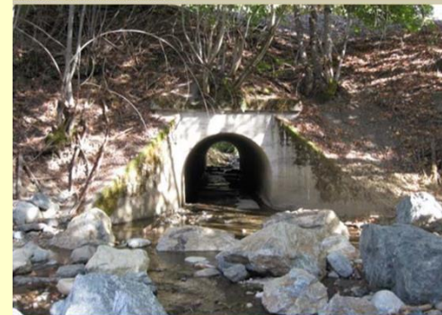
Salmon and Steelhead habitat improvement.

Nothing makes a fish bigger than almost being caught. ~ Anonymous