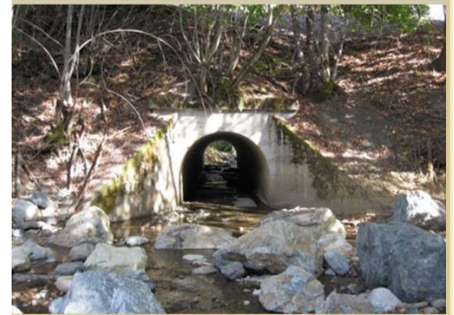
Salmon and Steelhead habitat improvement

Nothing makes a fish bigger than almost being caught. ~ Anonymous